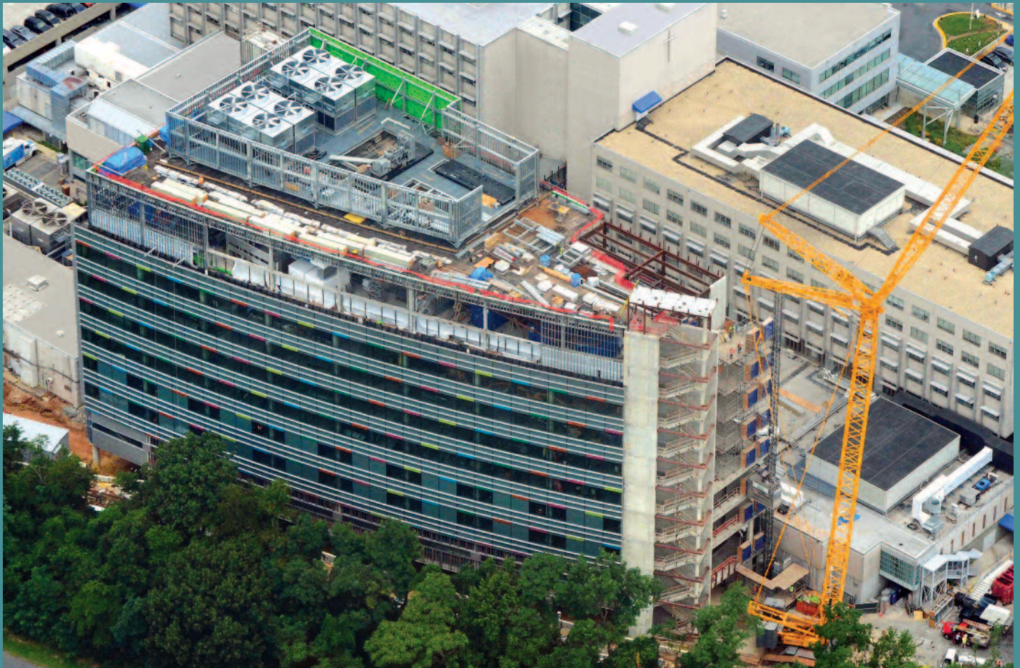
Holy Cross Hospital's brand new seven-story patient care building is the latest landmark on the Capital Beltway's skyline.

Holy Cross Hospital's brand new seven-story patient care building has risen on the south side of the hospital and will house 150 private rooms. It's the centerpiece of the Holy Cross Hospital expansion and modernization project that is targeted for completion in fall 2015.