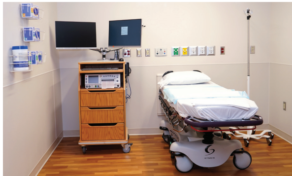
Expanded post-anesthesia care unit