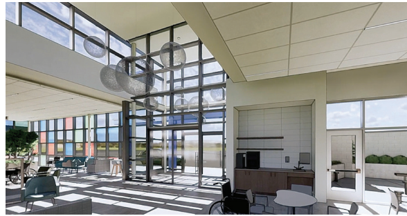
Main Reception Area