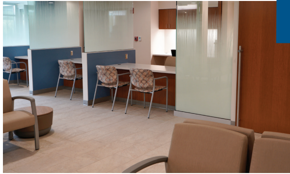
Renovated waiting area