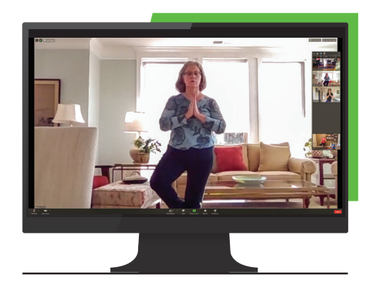
Virtual versions of fitness classes and support groups helped counter the sense of loneliness and isolation that so many experienced during the pandemic.

andemic closed inions, along with adult ograms and other brief caregivers, caregiver