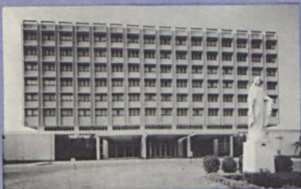
HOLY CROSS HOSPITAL OF SILVER SPRING 1500 Forest Glen Road Silver Spring, Maryland 20910